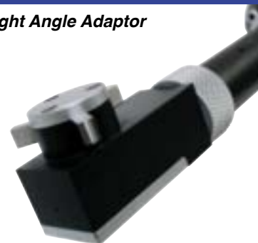
Right Angle Adaptor