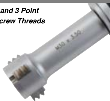
2 and 3 Point Screw Threads