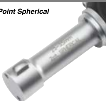
2 Point Spherical