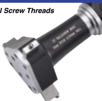
Ball Screw Threads