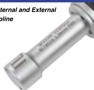
Internal and External Spline