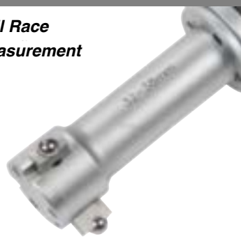
Ball Race Measurement