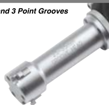
2 and 3 Point Grooves