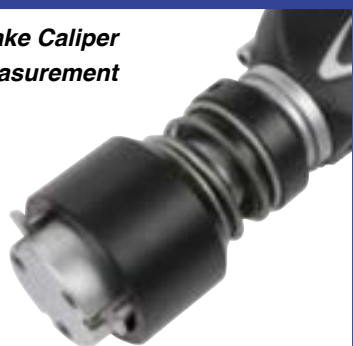
Brake Caliper Measurement